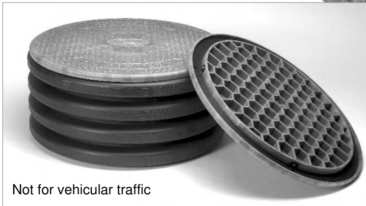
Not for vehicular traffic