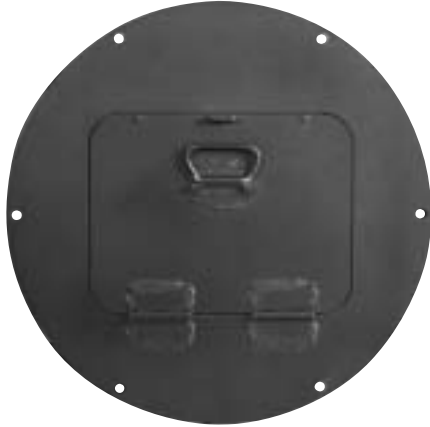
Shown as a Steel Hatch Cover